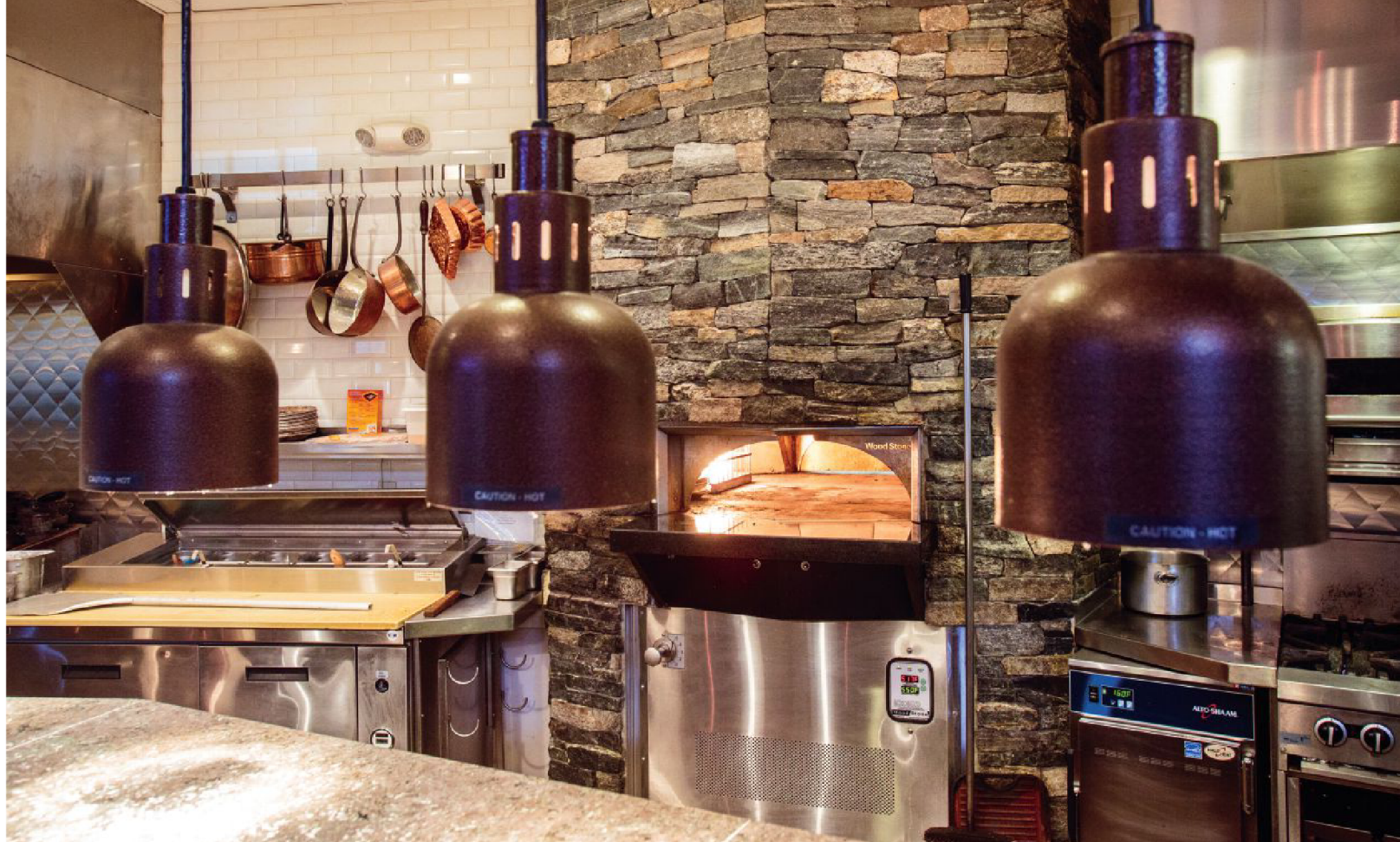
Further contributing to the overall upscale rustic ambience is a stone oven that can be seen from the main dining area due to the open-concept kitchen design.

tion for an outdoor dining terrace,” explained Boucher. “It is more cost effective, speedier for installation, and you can’t even tell that it is veneer.”