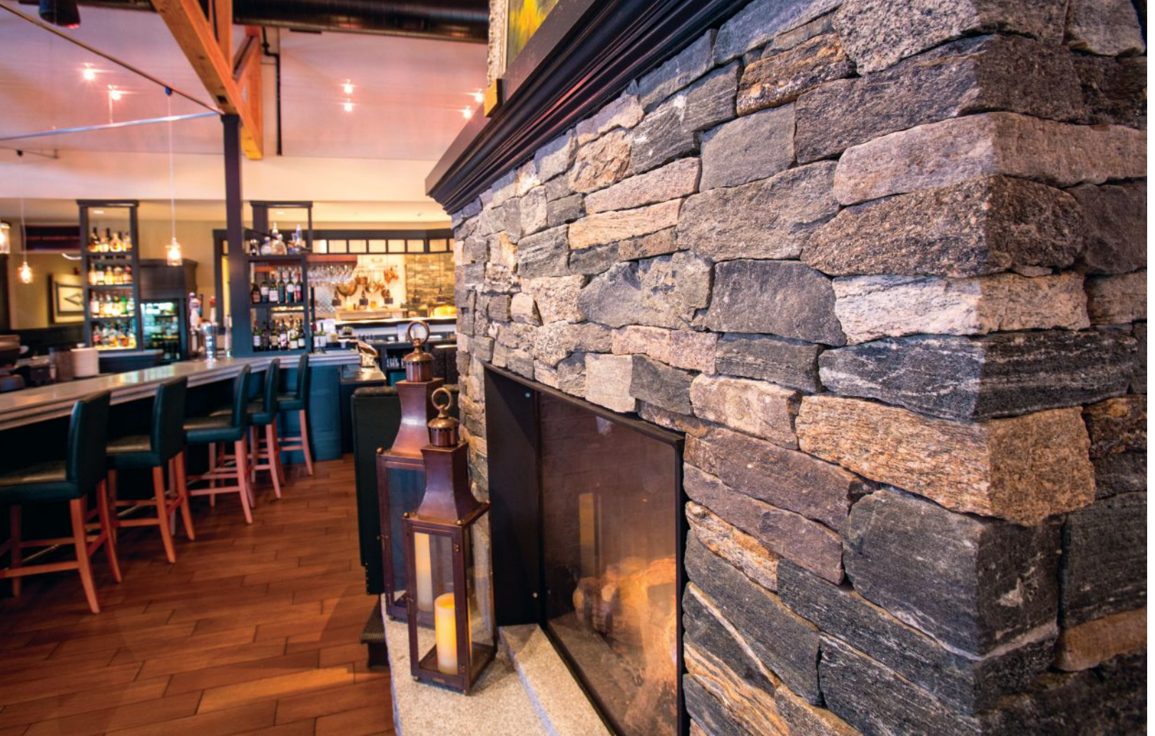
A total of 75% of the stone employed for the fireplace and oven design is Boston Blend LedgeStone. The pieces range in size from 1 to 4 inches in height and 4 to 18 inches in length. An additional 20% consists of Greenwich Gray LedgeStone with pieces also varying between 1 to 4 inches in height and 4 to 18 inches in length. The last 5% is Boston Blend Ashlar with pieces measuring 3 to 7 inches in height and 4 to 14 inches in length. All of the stone pieces have a thickness of 1 inch.

Elegant, warm and inviting are the three words designer Dana Boucher of Breath of Fresh Art uses to describe the interior dining space of the Copper Door restaurant in Bedford, NH. At the heart of the 8,000-square-foot design is a floor-to-ceiling fireplace with the surround and hearth built of a blend of three stone varieties, which were produced by Stoneyard.com of Littleton, MA, and supplied through Hudson Quarry of Hudson, NH. Further contributing to the upscale rustic ambience is a stone oven — featuring the same stone combination — that can be seen from the main dining area due to the open-concept kitchen design. The saturated colors and texture of the interior design elements make for a welcoming and comfortable environment for the restaurant's guests.